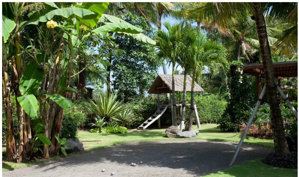
Dea Villas Estate