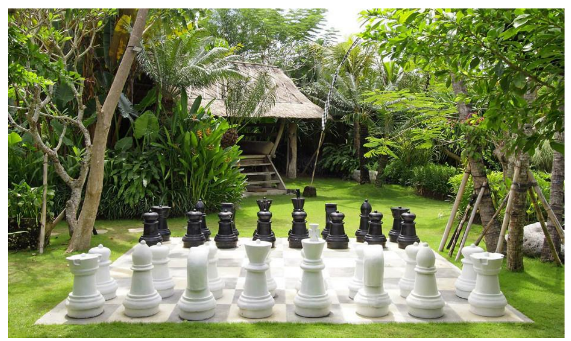
Dea Villas Estate

The Layar, Jalan Pangkung Sari No.10 X, Seminyak. p. +62 (0)361 733 262.