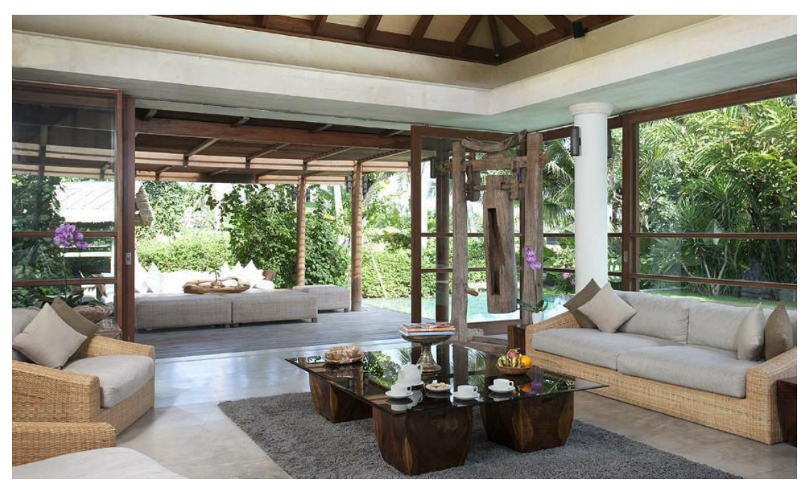
Dea Villas Estate